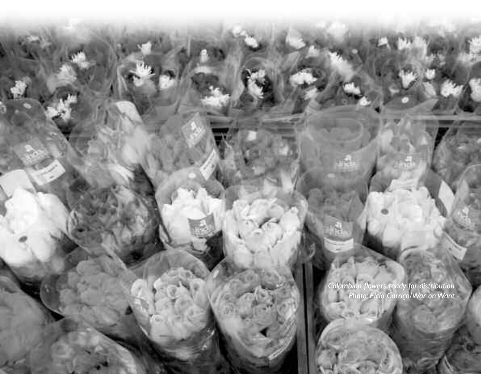
Colombian flowers ready for distribution

Since problems in the flower industry first came to light a decade ago, many standards and codes of conduct have been created in an effort to address these appalling working conditions and environmental impacts. However, these voluntary standards are failing to protect workers adequately for reasons such as an absence of unions to ensure that flower companies comply with the requirements, a lack of independent auditing and confusion over which standards to adhere to.