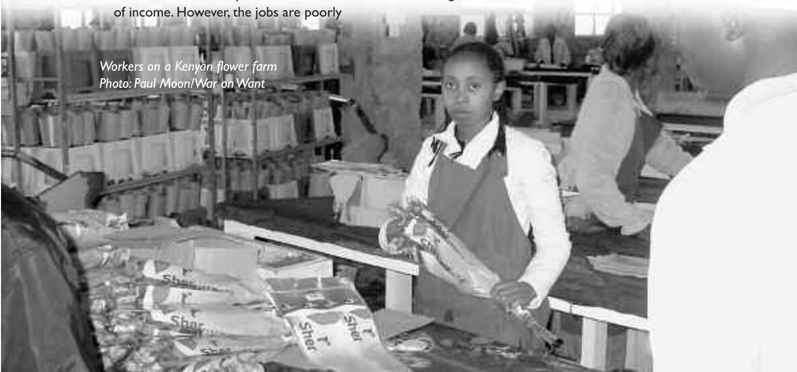
Workers on a Kenyan flower farm

The Savannah of Bogotá that houses Colombia’s flower industry – the second largest in the world – is also facing water shortages. The aquifer has fallen by 180 metres and water has to be imported from other regions. 10