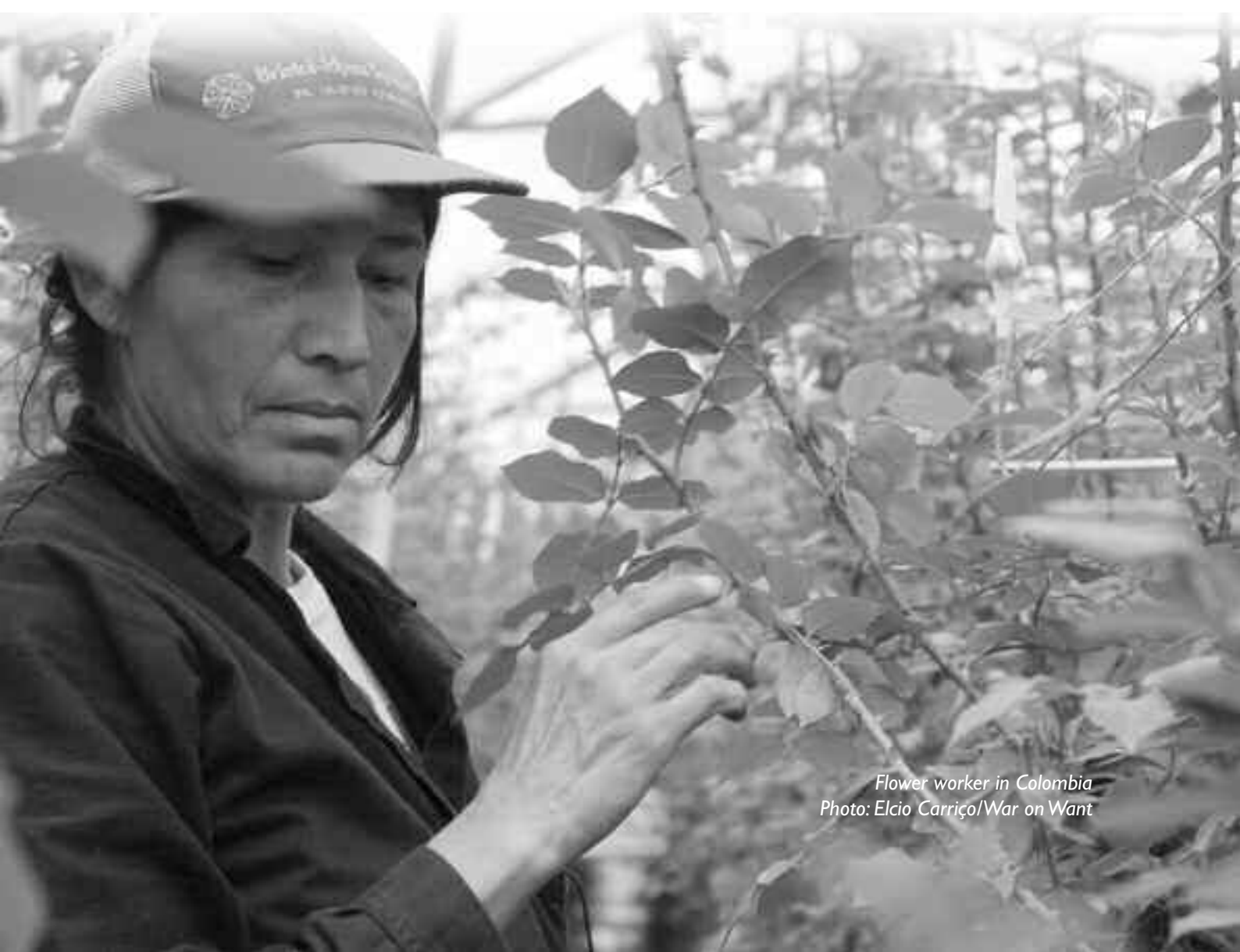
Flower worker in Colombia

Sexual harassment on flower farms is widespread, in part because of conditions that make women vulnerable. Women often work in very isolated conditions, in huge greenhouses where workers are spaced far apart and no one can hear or see what is happening. A study in Ecuador found 55% of workers surveyed had experienced sexual harassment at work. 20 Unfortunately, women are often reluctant to report or discuss harassment, in large part due to their lack of job security.